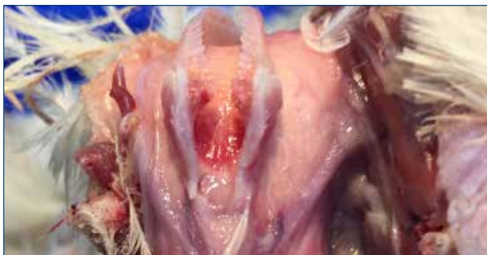
Figure 2. Inflammation of the larynx and trachea.

The ILT virus is an enveloped virus, making it vulnerable to many common commercial chemical disinfectants, including those with a lye, cresol, hydrogen peroxide, halogen-detergent, or iodophor base. The virus may also be rapidly inactivated (48 hours or less) in the environment under direct exposure to sunlight and/or high temperatures (38°C/100.4°F). In dark, damp, cool conditions, the virus may persist in organic material for as long as 100 days 1 .