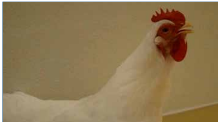
Figure 1. Chicken with neck extended, demonstrating respiratory distress.

Signs of disease in subacute outbreaks may resemble those of an acute event, but with a slower progression of disease, and mortality on the lower end of the spectrum (10–30%). Post-mortem findings are generally less marked in these instances.