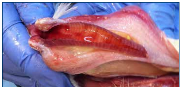
Figure 4. Hemorrhage within the trachea is a common sign of infection.