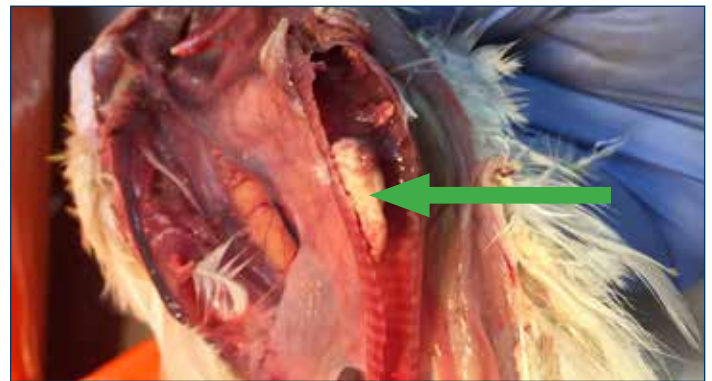
Figure 3. Fibrinohemorrhagic tracheitis characteristic of ILT. This plug may occlude the trachea and cause death from asphyxiation.

Clinical signs and necropsy lesions can be suggestive of ILT but cannot be differentiated from other diseases with similar presentation. The main differential diagnoses are Newcastle disease, infectious bronchitis, avian influenza, and wet pox. In particular, the clinical and post-mortem signs of ILT and wet pox may appear identical.