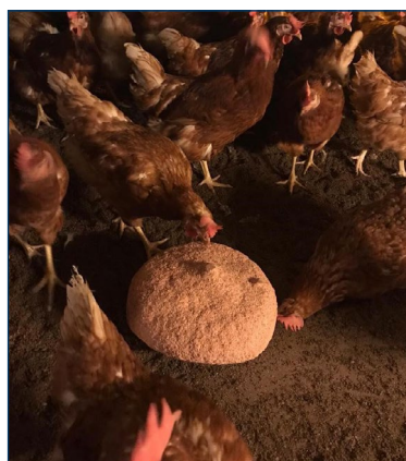
Figure 6. House enrichments: alfalfa (Lucerne) bales (left) and a pecking block (right).