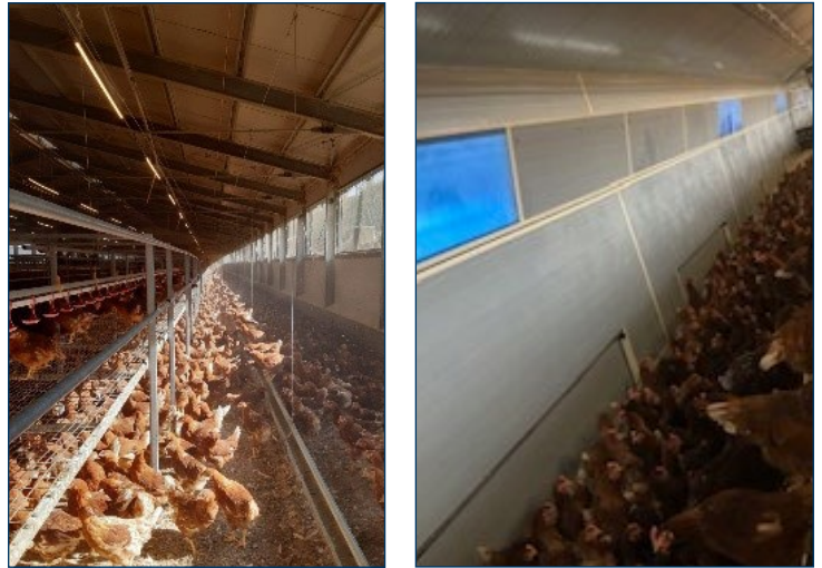
Figure 4. Natural daylight in rearing and laying houses.