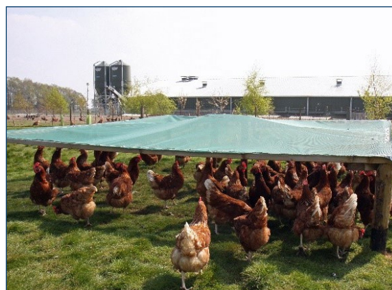
Figure 7. Free-range pasture with a shaded area.