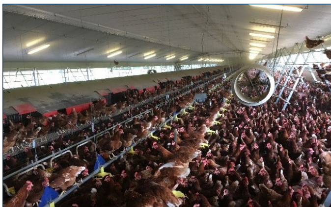
Figure 5. A natural ventilated house with circulatory fans.