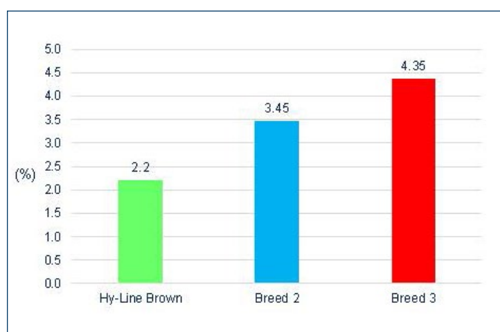
Figure 1. Mortality (%): Average of two fully beaked flocks (50.4 weeks in lay).