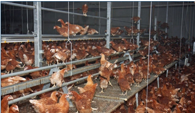
Figure 2. Use of an elevated platform in a rearing house.