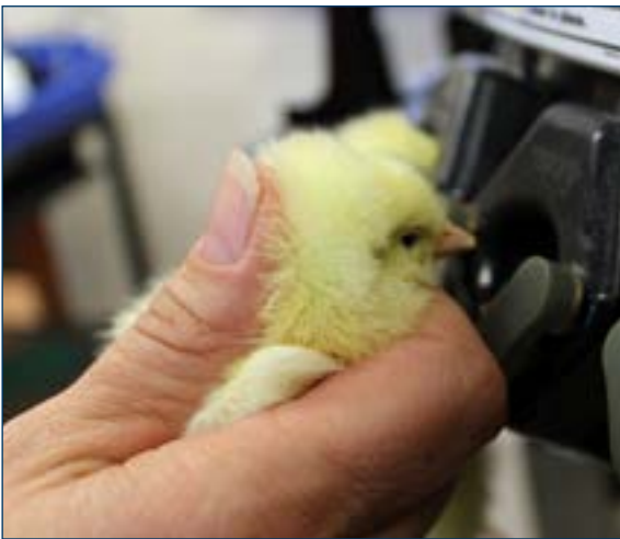
Figure 3. Placing chicks in head holders.