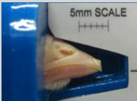
Figure 5. One day post-treatment—treated beak tissue is white (vs. pink).