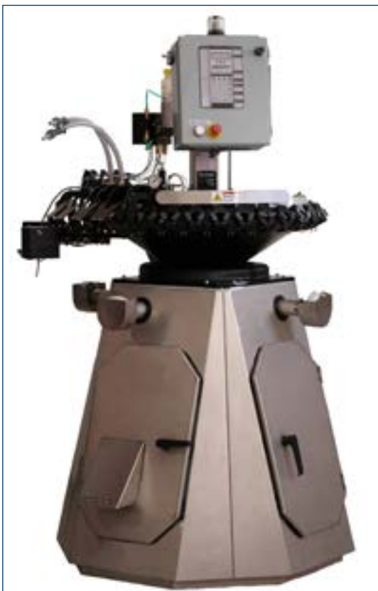
Figure 1. Nova-Tech PSP.

IRBT is performed by a machine called the Poultry Service Processor (PSP), patented by Nova-Tech and available for lease (Figure 1). This machine also provides subcutaneous injections in the neck, which greatly reduces the human error associated with hand or individual injectors.