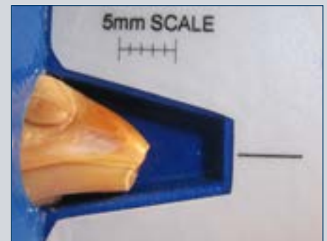
Figure 7. Four weeks post-treatment—rounded beak (not sharp).