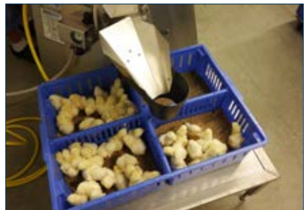
Figure 2. PSP sorting chicks into boxes.