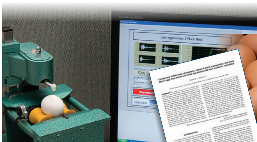
New technology to better test egg shell quality