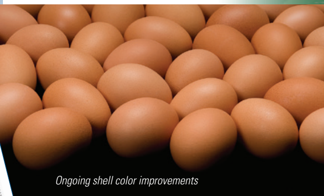
Ongoing shell color improvements