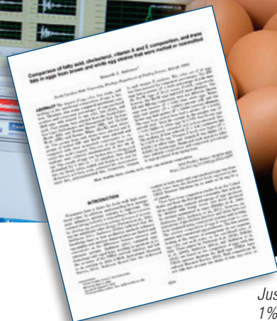
Just published! Hy-Line W-36 demonstrated 1% more solids than competitive layer