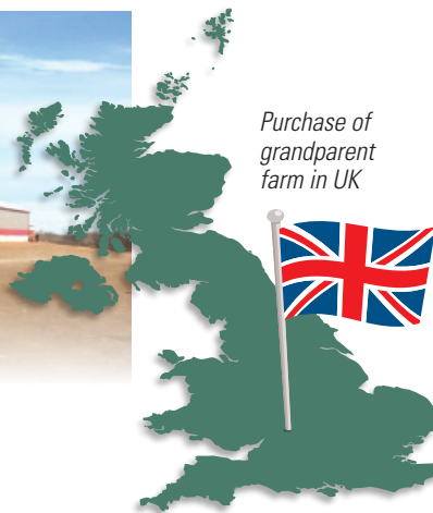
Purchase of grandparent farm in UK