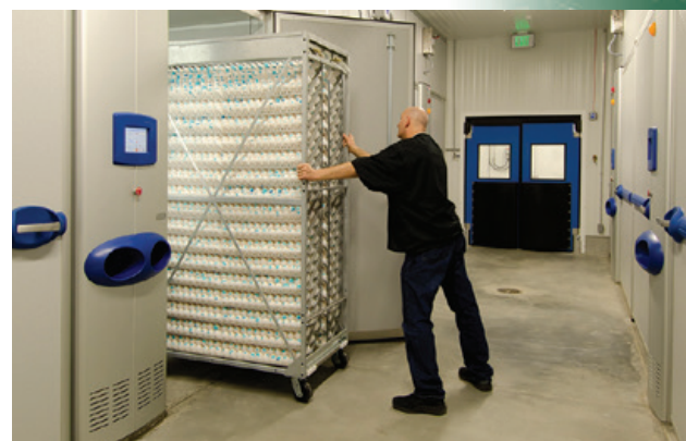
Dedicated grandparent and pure line hatchery opened 2012 to reduce disease risks

Investing in improved Quality Management software and personnel, building on our culture of continuous improvement in everything we do, every day