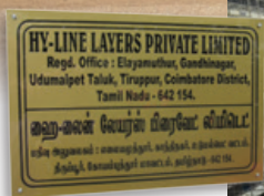
New Grandparent Farm in India