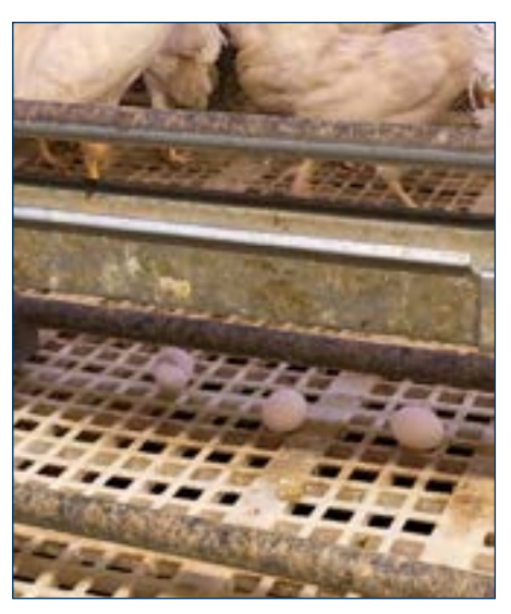
Figure 8. This LED light source produces directional light that creates distinct areas of light and shade under the feeder and perch, causing floor laying.