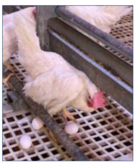
Figure 7. The space between the feed trough and perch used as an alternative nesting site.