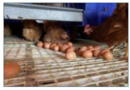
Figure 9. Unwanted egg laying under the feeders.