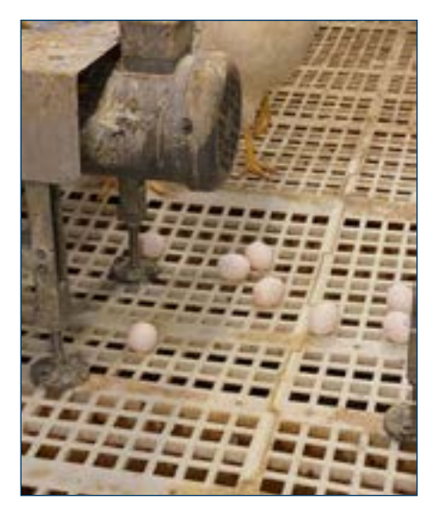
Figure 6. The shaded area under the feeder motor used as an alternative nesting site.