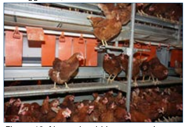
Figure 13. Nests should have a staging area at the entrance to allow hens to examine the nests with easy access and sufficient space for movement.