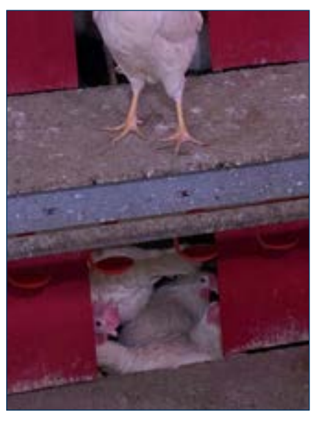
Figure 2. Gregarious laying behavior is more common in young inexperienced hens.

Nesting is a learned behavior, but once established in a hen, it becomes difficult to change. Hens tend to return every day to the same nesting sites. Consistent nest layers and floor layers can be identified in a flock (3). The management challenge for egg producers is to make the designated nests attractive to hens and eliminate alternative nesting sites where hens might lay out-of-nest eggs.