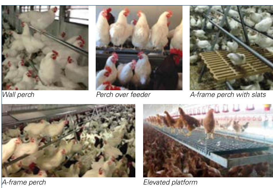
Figure 3. Types of perches.

Perches and elevated water platforms should be present in the rearing flock by 10 days of age to establish jumping behavior in the young pullets and develop strength in leg and breast muscles. Perches provide a safe resting space for birds and lowers the density of birds on the floor. The ability of pullets to use perches will be important later for accessing elevated nests. Hy-Line research has shown that the use of perches resulted in a decrease in the incidence in floor eggs (14). The type of perches used in rearing should be the same design and material as those to be used