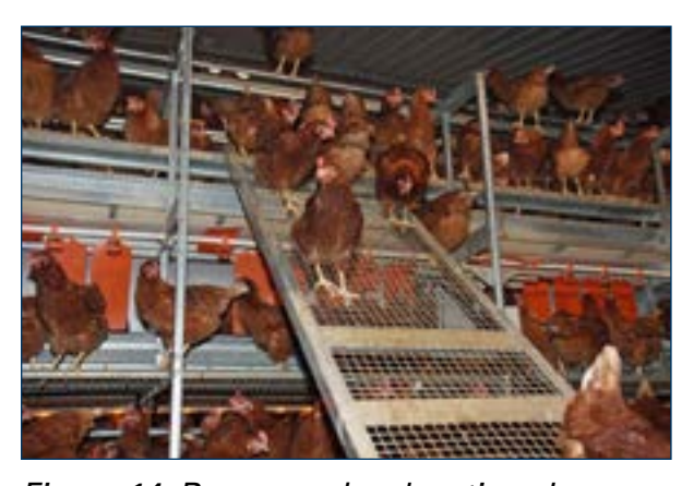
Figure 14. Ramps make elevation changes easier and reduces crowding in front of the nests. Use ramps when the elevation change is greater than 90 cm.