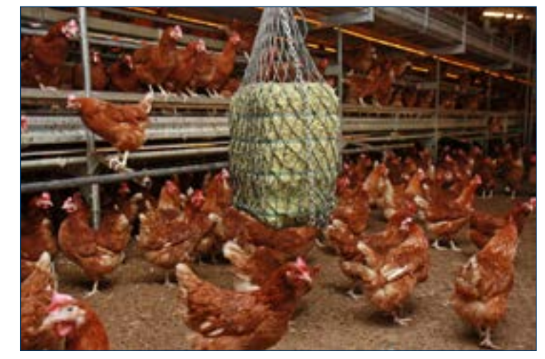
Figure 5. Enrichments, such as lucerne (alfalfa) bales, should be suspended so as not to encourage birds to lay next to them or block hen movement to nests.

Automatic nests should be opened two hours before lights on, and closed two hours before lights off. When using dawn/dusk sequential lighting, the nests can be opened two hours before the beginning of the dawn light sequence. Nest closing can be one hour before the dusk lighting sequence. The last feeder run should be scheduled just prior to nest closing to pull hens out of the nests that may otherwise be settling in for the night.