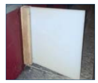
Figure 12. Placing partitions (false walls) between the nests can reduce overcrowding in corner and end of the line nests.

and landing platforms in front of nests should be easy to access and traverse (Figure 13). If hens have to jump to access the nests, the vertical height is ideally 65 cm (25.6 in), but not exceeding 90 cm (35.4 in)(Figure 14).