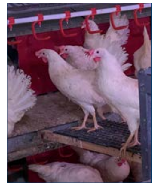
Figure 1. Pre-lay behavior in hens includes making many visits to examine potential nesting sites before making a final nest selection.

Pre-Laying Behavior. One to two hours before laying an egg, the hen will become restless and begin examining potential nesting sites as a part of the pre-lay ritual. A hen makes frequent nest visits before final nest selection, averaging 21.3 nest visits per egg laid (7). Between these nest examinations, the hen might eat, drink, and preen, as well as other behaviors (Figure 1). After selecting a site, the hen may turn around several times, exhibiting nest building behavior. If loose nesting material like sawdust is present, the hen spends more time nest building. Just before laying an egg, the hen extends the neck and body feathers. Some hens will stand to lay their egg. The time for the hen to lay an egg is highly variable