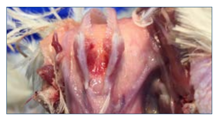
Figure 2. Inflammation of the larynx and trachea.

The ILT virus is an enveloped virus, making it vulnerable to many common commercial chemical disinfectants, including those with a lye, cresol, hydrogen peroxide, halogen-detergent, or iodophor base. The virus may also be rapidly inactivated (48 hours or less) in the environment under direct exposure to sunlight and/or high temperatures (38°C/100.4°F). In dark, damp, cool conditions, the virus may persist in organic material for as long as 100 days (4).