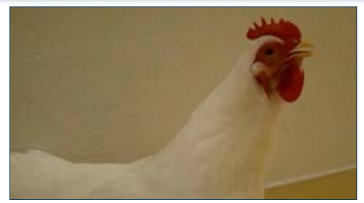
Figure 1. Chicken with neck extended, demonstrating respiratory distress.

Signs of disease in subacute outbreaks may resemble those of an acute event, but with a slower progression of disease, and mortality on the lower end of the spectrum (10–30%). Postmortem findings are generally less marked in these instances.