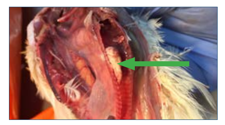
Figure 3. Fibrinohemorrhagic tracheitis characteristic of ILT. This plug may occlude the trachea and cause death from asphyxiation.

Clinical signs and necropsy lesions can be suggestive of ILT but cannot be differentiated from other diseases with similar presentation. The main differential diagnoses are Newcastle disease, infectious bronchitis, avian influenza, and wet pox. In particular, the clinical and post-mortem signs of ILT and wet pox may appear identical.