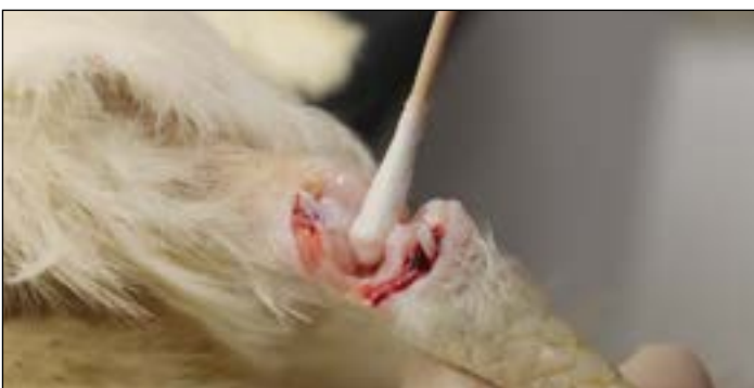
Figure 6. Swab the synovial surface of the affected joint.