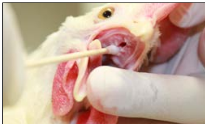
Figure 3. Be sure to insert swab into the choanal cleft when collecting oropharyngeal swabs.