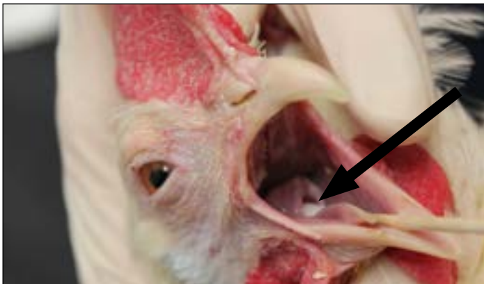
Figure 4. The swab is inserted gently through the glottis into the trachea.

It is advised to confirm the proper type of swabs and necessity for enrichment media for sample collection and transport. Prior communication with the diagnostic lab will ensure correct sample handling and expedite processing. When submitting swab samples in liquid media such as brain-heart infusion broth (BHI), many laboratories request that the actual swab is not included in the tube. The proper procedure in this case is to gently swish the swab in the media to wash off any material, and then roll the swab against the tube as it is pulled out to drain any excess fluid from the swab that may contain pathogenic material. Depending on the test, 5 to 11 individual swab samples can be pooled together without reducing the sensitivity of the PCR.