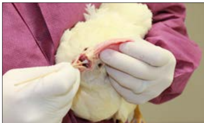
Figure 2. Proper technique for restraining the bird while collecting oropharyngeal swabs.