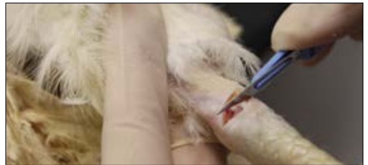
Figure 5. Remove feathers and clean the skin with an alcohol pad before cutting into the joint of a euthanized bird.