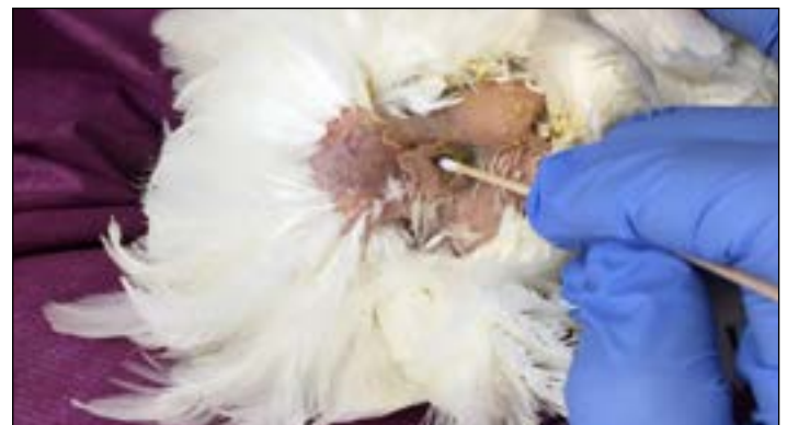
Figure 7. Expose the cloaca and insert the swab gently into the cloaca and rotate the swab over the mucosal surface.